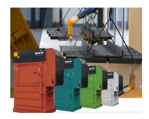
You may choose other RAL colours for your