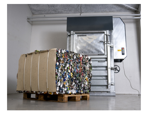
A galvanized surface makes your baler environmentally resistant.