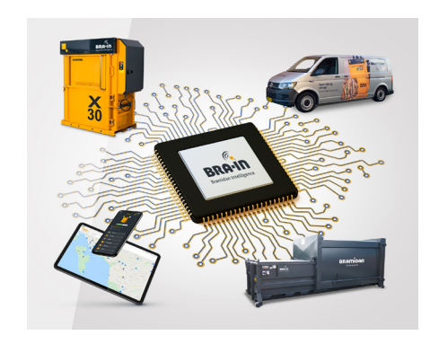
Get online access to your balers with our monitoring system called BRA-IN.