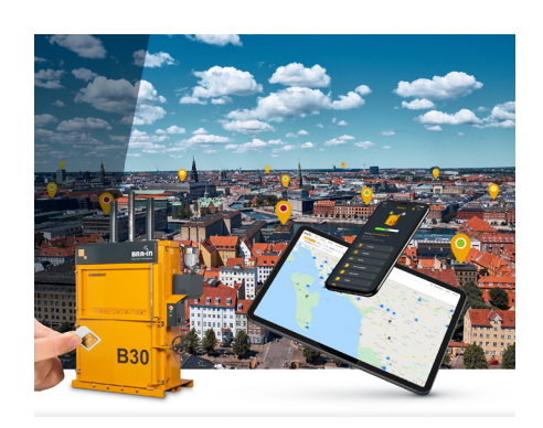
BRA-IN fleet monitoring system is included and gives you the ability to monitor the throughput of your machine remotely.