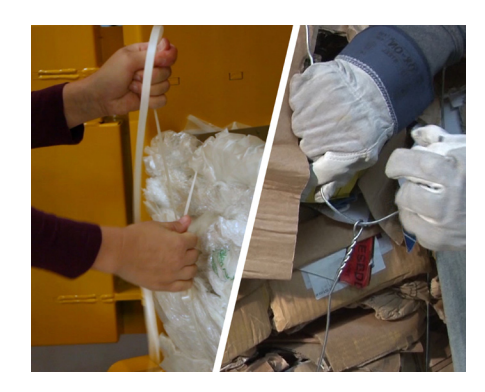
You can use either plastic strapping or baling wire to tie the finished bales.